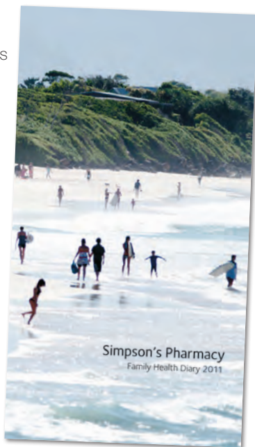
Cover Version B: Beach scene