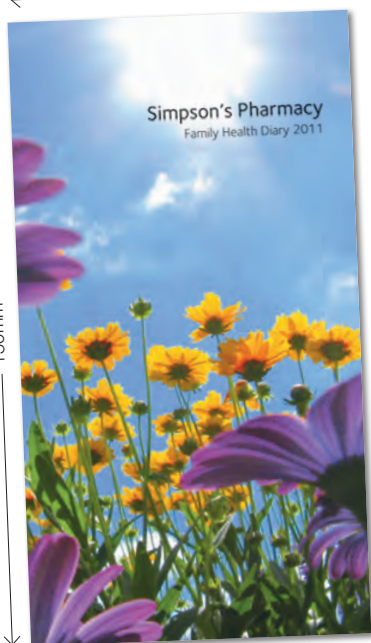
Cover Version A: Daisies

The 144-page diary is specially designed for Pharmacy and includes useful information on health and medicine-related issues.